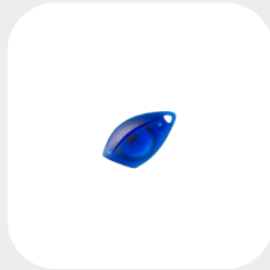
EM 4102 SAIL 56 x 32 x 8 mm