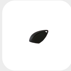
EM 4102 SAIL 56 x 32 x 8 mm