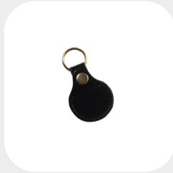
LEATHER KEYRING Optional accessory product for EM 4102 (2402 Tag)