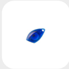
EM 4102 SAIL 56 x 32 x 8 mm