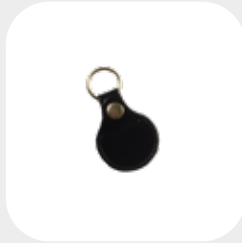
LEATHER KEYRING Optional accessory product for EM 4102 (2402 Tag)