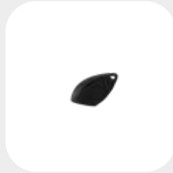
EM 4102 SAIL 56 x 32 x 8 mm