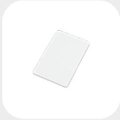
CARD 86 x 54 mm