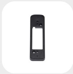
SMALL 140 x 49 x 10 mm