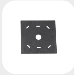
QUATTRO 93 x 93 x 1 mm