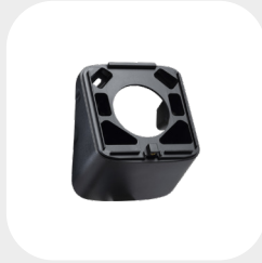
QUATTRO 33° 105 x 90 x 48 mm