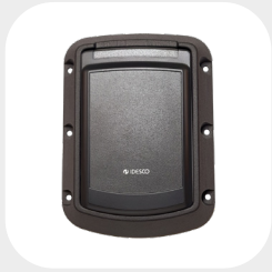
IDESCO VANDAL COVER 160 x 118 X 30 mm