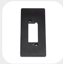
LARGE 170 x 80 x 10 mm