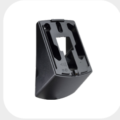
VM 33° 157 x 94 x 72 mm