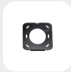
QUATTRO 87 x 87 x 7 mm