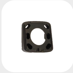
QUATTRO 10° 87 x 86 x 27 mm