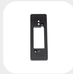
SLIM 140 x 44 x 11 mm