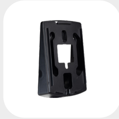
VM 10° 130 x 87 x 26 mm