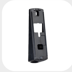
VS 10° 154 x 48 x 30 mm