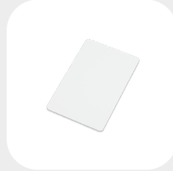
IDESCO EPC DESFIRE CARD 1 x 54 x 85,6 mm