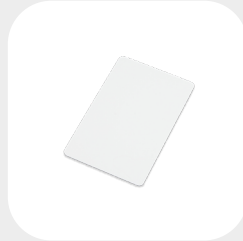
IDESCO EPC MIFARE CARD 1 x 54 x 85,6 mm