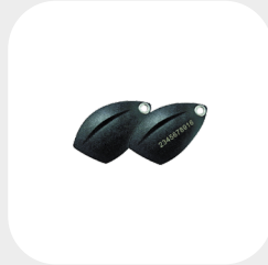
IDESCO EPC SAIL TAG 8 x 32 x 56 mm