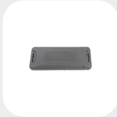
IDESCO EPC EXO3000 TAG PC 17,6 x 70 x 174 mm