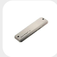
EPC METAL TAG ABS MAX RIGID CP15429 8,4 x 33 x 104 mm