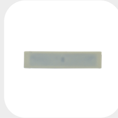
EPC SILICONE TAG WT-A543 GR 1,6 x 10 x 55 mm