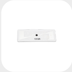
IDESCO EPC WINDSHIELD LABEL 0,2 x 40 x 110 mm